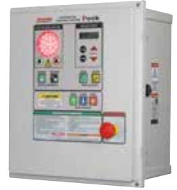
Integrated Control Panel Shown (Size varies with options)

WARRANTY: All PowerHook vehicle restraints feature a full two (2) year base warranty on all structural, hydraulic and electrical parts, including freight and labor charges in accordance with Systems, LLC's Standard Warranty Policy. Structural and hydraulic components carry an additional full three (3) year extended warranty with parts and labor. Systems, LLC warrants all components to be free of defects in materials and workmanship, under normal use, during the warranty period. This base warranty period begins upon the completion of installation or the sixtieth (60th) day after shipment, whichever is earlier.